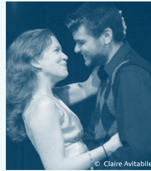
Standards of Care, funded by PFund, May 2008.

Actors at the 20% Theatre Company come from everywhere, and represent the best person for each part. But what exactly does that mean? To start, the theatre takes the philosophy that gender is performative. Meaning, "femaleness" and "maleness" are concepts that are performed or expressed separately from biology. While most theaters assume that "male" or "female" roles look a certain way, the 20% Theatre does not. Its auditions