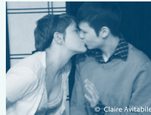
Standards of Care, funded by PFund, May 2008.